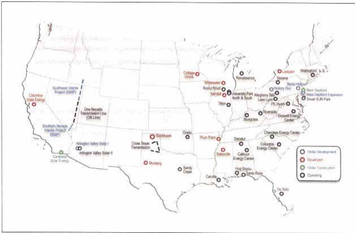
Figure 1 – LS Power Experience

Northeast Transmission Development is a member of the LS Power Group. LS Power is an experienced developer of large-scale energy projects, including several transmission projects. Since 1990, LS Power has had the technical and engineering capability to develop, own and/or operate over 30,000 MW of power generation facilities and two large high-voltage (345 kV and 500 kV) transmission projects totaling over 700 circuit-miles. Figure 1 provides an overview of the national footprint of LS Power Group's experience.