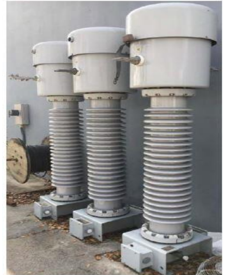
Figure 1: Three hermetically sealed oil-filled current transformers [1]