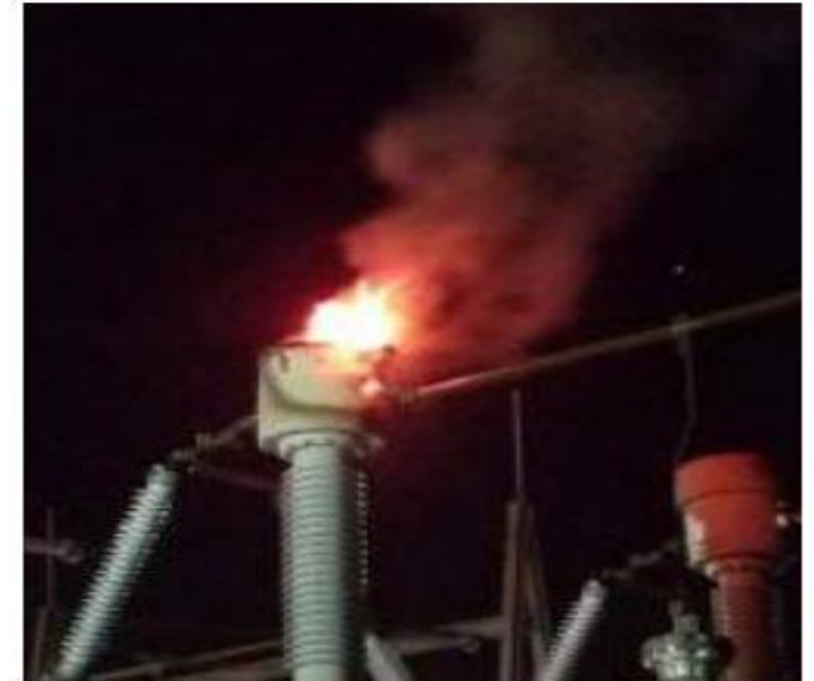
Figure 2: C-phase CT failure [1]