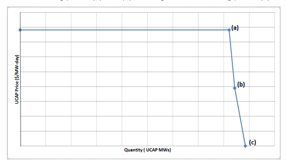
Exhibit 1: Illustrative Example of a Variable Resource Requirement Curve

The graph below illustrates the process for plotting the Variable Resource Requirement curve. The VRR Curve is plotted by combining a horizontal line from the y-axis to point (a), a straight line connecting points (b) and (c).