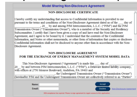
Deadline Passed Certificate Acceptance Mockup